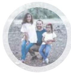
Child & Family Therapy

A T PENNSYLVANIA COUNSELING SERVICES, our core belief is "people are valuable." Our services are designed to contribute to your personal growth, support you through your struggles, help you develop healthy relationships, and ultimately, help you reach your full potential.