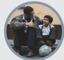
Children & Family Therapy

SEE REVERSE SIDE FOR SERVICES AND CONTACT INFORMATION