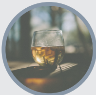
Drug & Alcohol Treatment