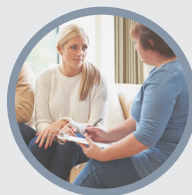
Mental Health Counseling