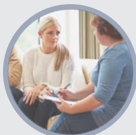
Counseling & Life Skills Training