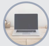
Resources for Recovery

SEE REVERSE SIDE FOR SERVICES AND CONTACT INFORMATION