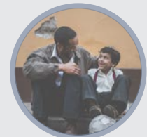
Children & Family Therapy

SEE REVERSE SIDE FOR SERVICES AND CONTACT INFORMATION