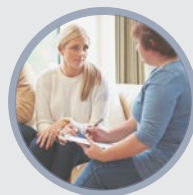
Mental Health Counseling