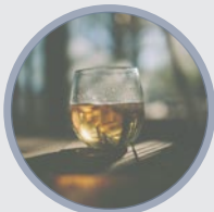
Drug & Alcohol Treatment